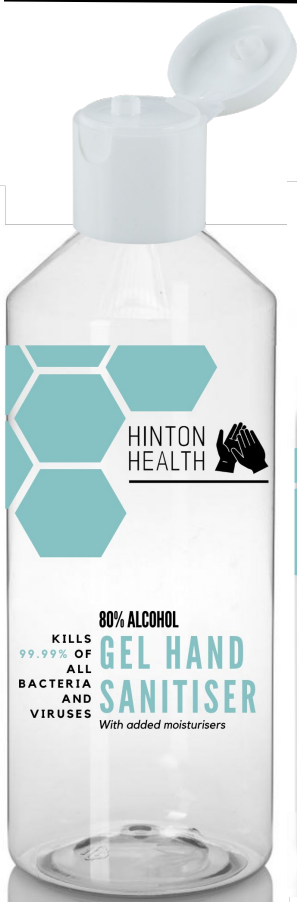
Conical 500ml bottle with flip-cap (80% alc. content)