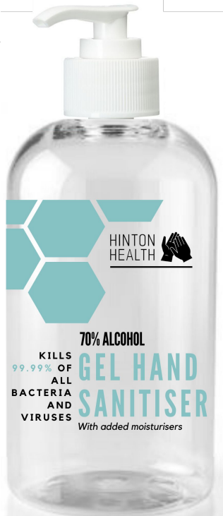
Boston 500ml bottle with lotion pump