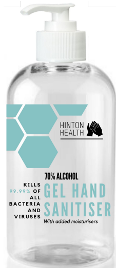
Boston 250ml bottle with lotion pump